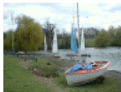
Maidstone S. C.